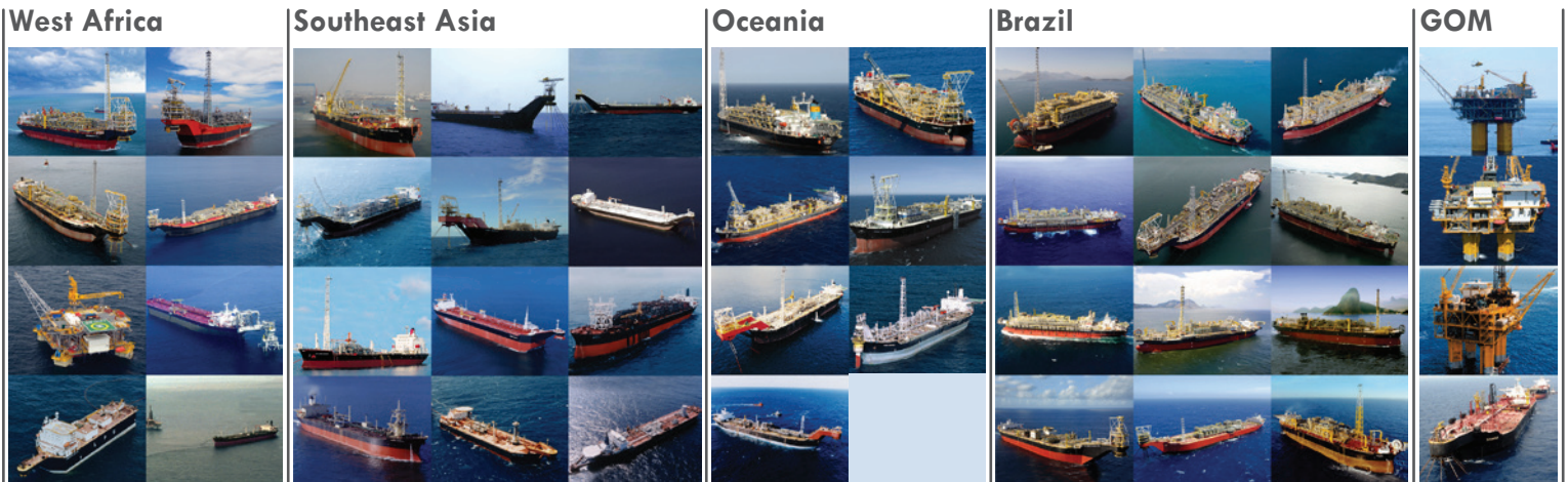
FPSO "Prof. John Evans Atta Mills" Ghana